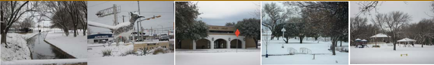
@ the Library